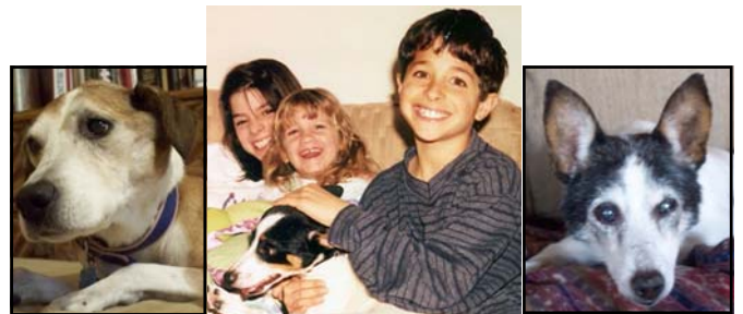
Penny (left) and Nelson (right) have always been stars to their family!